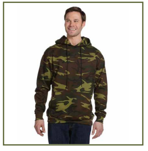
S-XL: $55.00 2XL: $57.00 3XL: $59.00