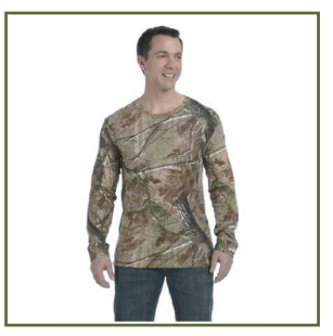
S-XL: $30.00 2XL: $32.00 3XL: $36.00 4XL: $38.00