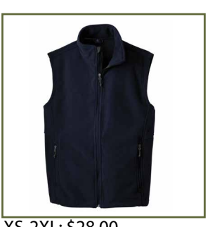
XS-2XL: $28.00 3XL: $30.00 4XL: $34.00 5XL: $36.00 6XL: $38.00