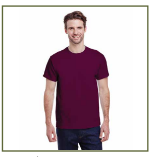
S-XL: $15.00 2XL: $16.50 3XL: $18.00 4XL: $19.50 5XL: $21.00