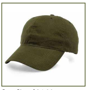
One Size: $24.00