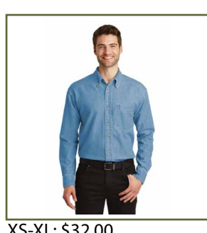
XS-XL: $32.00 2XL: $34.00 3XL: $36.00 4XL: $38.00