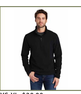
XS-XL: $30.00 2XL: $32.00 3XL: $34.00 4XL: $36.00 5XL: $38.00 6XL: $40.00