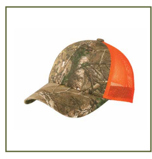
One Size: $18.00

COLOR: Mossy Oak New Break-up Country, Real Tree Hardwoods