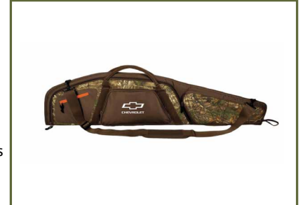
Front Load Pro Rifle Case #GP10002