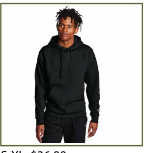
S-XL: $36.00 2XL: $38.00 3XL: $40.00