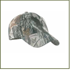
One Size: $18.00