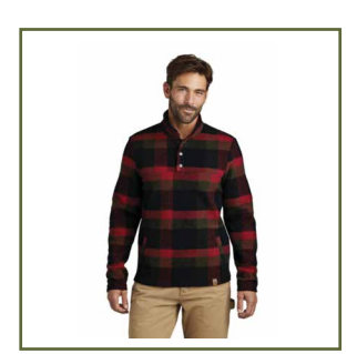
S-XL: $72.00 2XL: $74.00 3XL: $76.00 4XL: $78.00