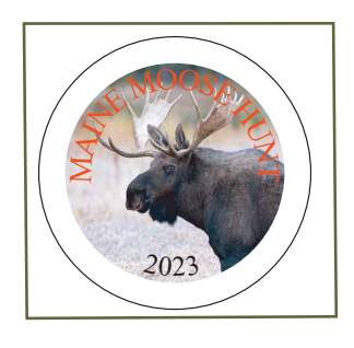
Moose Hunt Patch #sub3

COLOR: Mossy Oak Break Up Country , or Mossy Oak/ New Break-Up