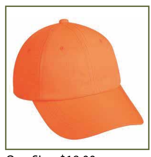
One Size: $18.00