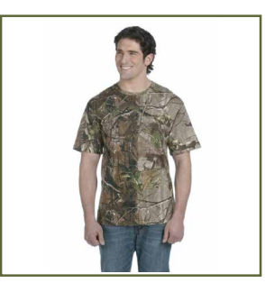
S-XL: $25.00 2XL: $26.00 3XL: $28.00