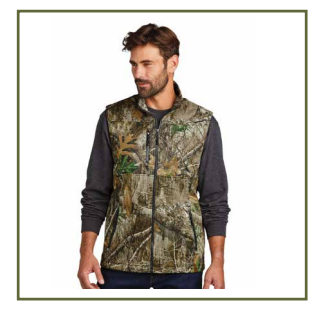
XS-XL: $70.00 2XL: $72.00 3XL: $74.00 4XL: $78.00